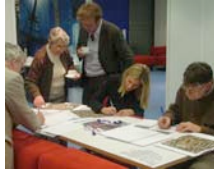
Greenwich hospital site 02.jpg