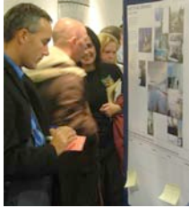
Greenwich hospital site 01.jpg

Open House exhibition on 7 November 2005 and design workshop on 9 November 2005 at the Dome hospitality suite, Greenwich peninsular, London