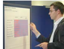
Greenwich hospital site 06.jpg