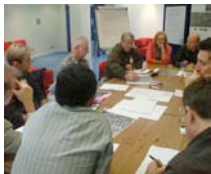
Greenwich hospital site 10.jpg