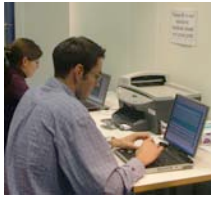
Greenwich hospital site 04.jpg