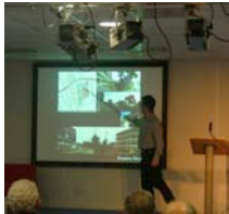
Greenwich hospital site 07.jpg