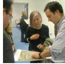
Greenwich hospital site 03.jpg