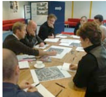
Greenwich hospital site 08.jpg