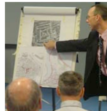
Greenwich hospital site 12.jpg