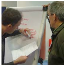
Greenwich hospital site 11.jpg