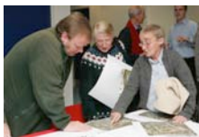
Greenwich hospital site 13.jpg