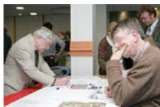
Greenwich hospital site 14.jpg