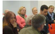
Greenwich hospital site 09.jpg